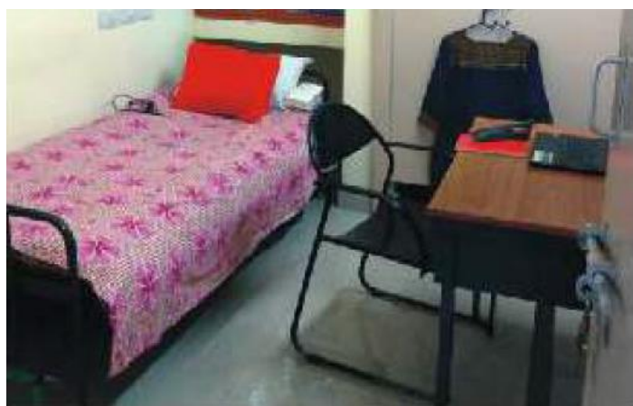
Figure 5: Typical Room at IIT Madras

I was allocated in the Bhadra Hostel. Obviously, everything was a bit different than what I was used to in Munich. But I considered everything as part of the experience of living abroad and embraced it. The rooms are usually very small, but since I spend most of my time outdoors that did not end up being a problem. I also decorated my room with a lot of pictures and some little souvenirs I kept on collecting from my trips. That made my room feel like home after a couple of weeks on campus. If I would go on trip during a long weekend, arriving back to campus, to your own room, was a nice feeling, almost as arriving back home.