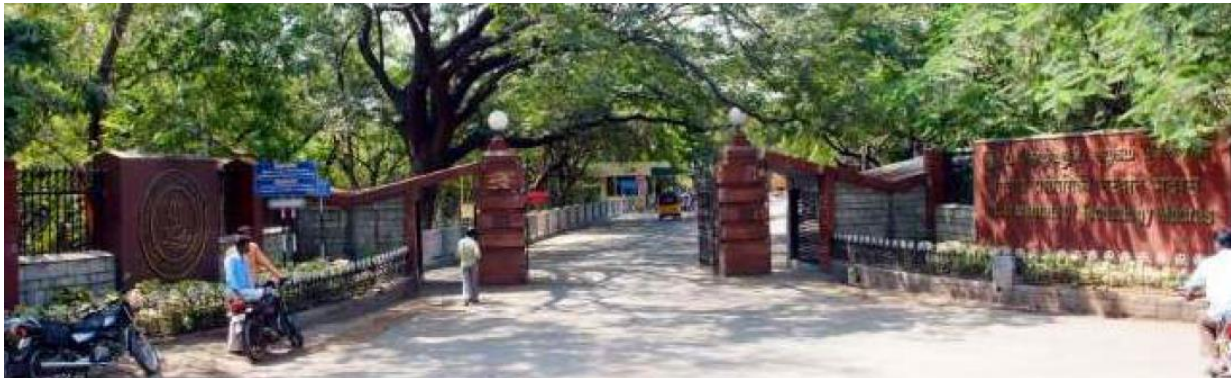
Figure 1: Entry Gate IIT Madras

I completed my semester abroad at the Indian Institute of Technology Madras (IITM) in Chennai, India. Before commencing my exchange, I did my research on India and this is what I initially found out. The city of Chennai, also known by its former name Madras, had awoken my interest in different ways. Being the fourth largest city in India with more than 7 million inhabitants, and with one-third of India's automobile industry located in North Madras, Chennai had deeply impressed me. As an undergraduate student in Mechanical Engineering, this manufacturing center provided an interesting look into the engineering world in different countries. It also has impactful nature, with Marina Beach, one of the longest natural urban beaches in the world.