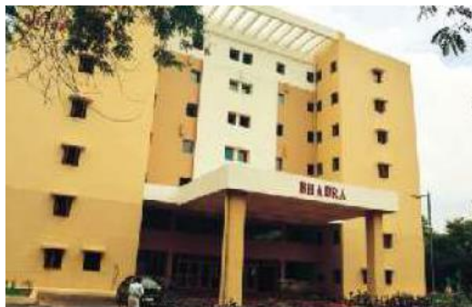
Figure 4: Bhadra Hostel

At IIT Madras all students, staff and workers live on campus. As an exchange student, you will be provided accommodation in any one of the hostels on payment basis (approx. Rs. 19,000/- per semester). You have to bear the normal living expenses, food expenses (approx. Rs. 100 per day in the hostel mess) and travel expenses. No tuition fee will be levied.