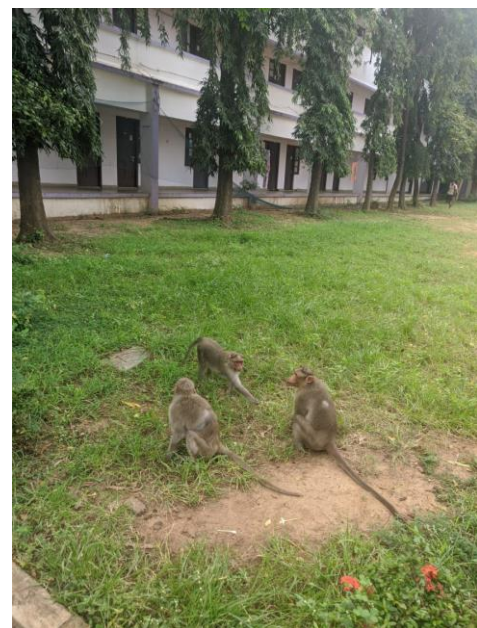
Figure 7 : Wild life on Campus.