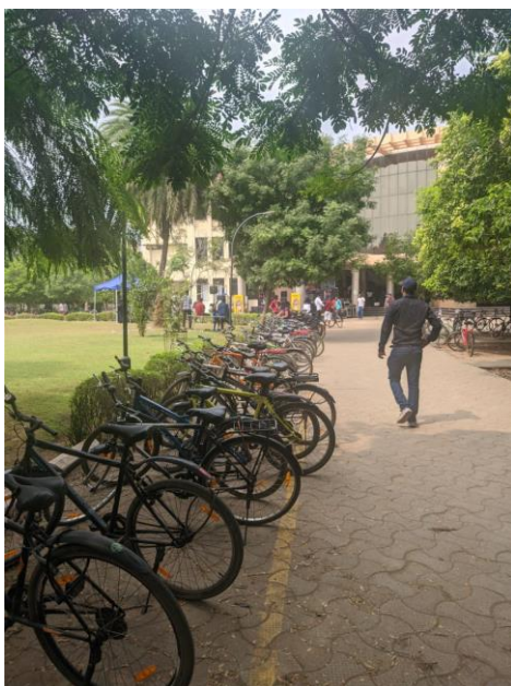
Figure 6: The favorite mode of transport on campus among students is by bicycle.

However, I had plenty of great experiences. Starting with life on campus, I really enjoyed the campus style of life. All the students would live together and that created a very special bond between some of us. I really enjoyed my free time with them, practicing sports or playing music or simply hanging around. On the other hand, travelling around India has also been an amazing experience. Out of all the places I have had the chance to visit, my greatest experiences were discovering Hampi, sleeping in the desert in Jaisalmer and visiting the Taj Mahal in Agra.