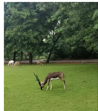
Figure 3: Wild life on Campus.